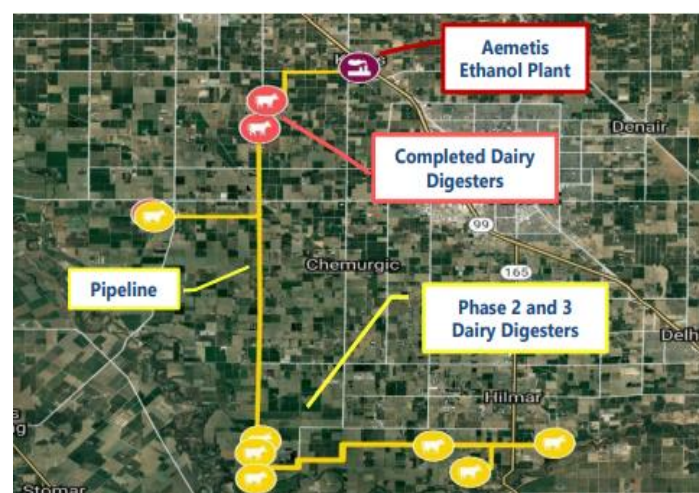
Exhibit 6: Dairy Biogas System