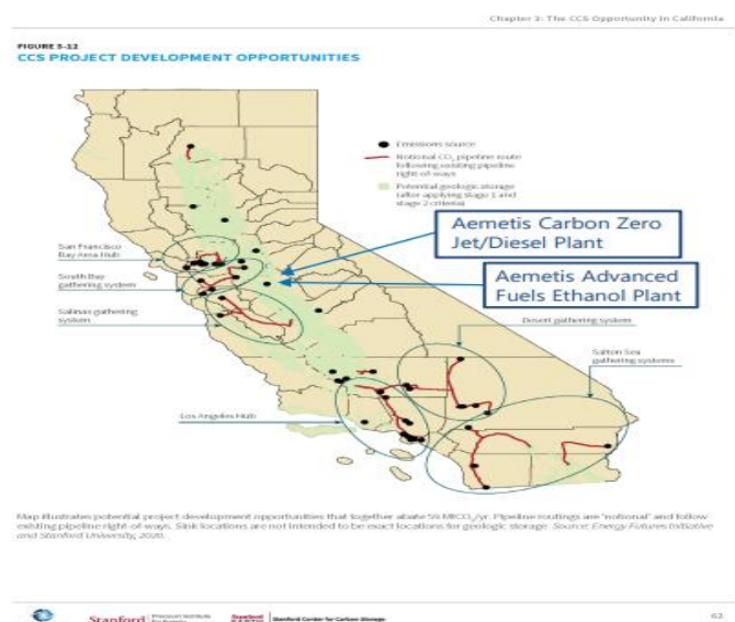
Exhibit 8: Aemetis CCS Projects

In April 2021, the Company established Aemetis Carbon Capture, Inc. to build Carbon Capture Sequestration projects to generate LCFS and IRS 45Q credits by injecting CO 2 into wells, which are monitored for emissions to ensure the long-term sequestration of carbon underground. California's Central Valley has been identified as a highly favorable region for large-scale CO 2 injection projects because of the subsurface geological formation that retains gases.