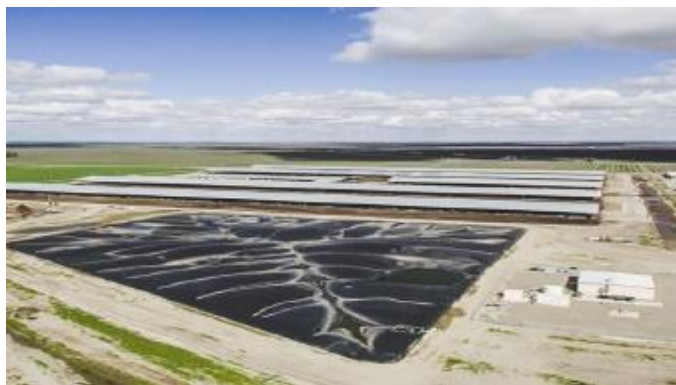
Exhibit 1: Dairy Biogas System