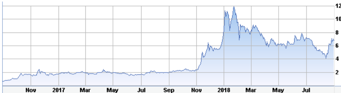
ACB – 2-year chart

Aphria (TSX:APH; OTCQB:APHQF) (Market Cap: $3.5B CAD): On August 31, 2016, APHQF shares closed at $1.97 USD; on August 31, 2018, APH shares closed more than 550 percent higher at $12.96 USD, reaching as high as $18.10 on January 10, 2018.