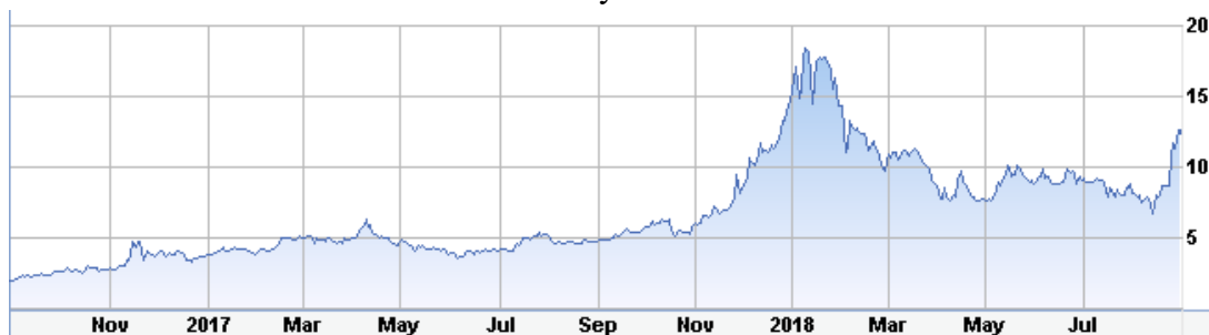
APH – 2-year chart

Cronos Group (NSDQ:CRON) (Market Cap: $1.8B USD): On August 31, 2016, CRON (formerly OTC:PRMCF) shares closed at $.39 USD; on August 31, 2018, CRON shares closed more than 2400 percent higher at $9.88 USD.