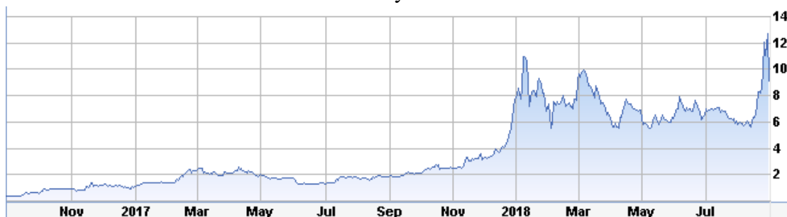
CRON – 2-year chart

Cronos Group (NSDQ:CRON) (Market Cap: $1.8B USD): On August 31, 2016, CRON (formerly OTC:PRMCF) shares closed at $.39 USD; on August 31, 2018, CRON shares closed more than 2400 percent higher at $9.88 USD.