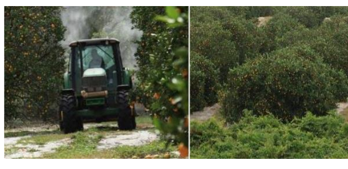
Exhibit 3: Alico Citrus Groves

Alico is one of the largest citrus growers in the US with \sim 49,000 gross prime citrus acres throughout seven counties in Florida (Hendry, Polk, Collier, DeSoto, Charlotte, Hardee, and Highland). The Company has a leading market share of the Florida citrus industry, with an 14% - 15% market share.