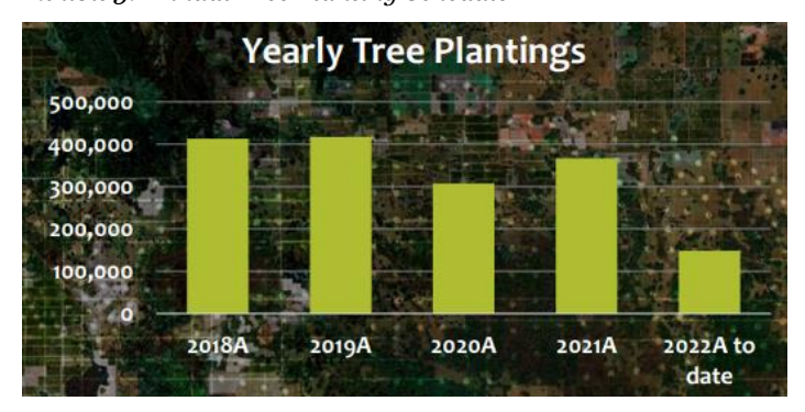
Exhibit 5: Annual Tree Planting Schedule

higher future production. Citrus trees become fruit bearing in approximately four to five years after planting and begin to peak around seven to eight years after planting, and Alico expects to see the positive impacts of the new plantings over the next several years.