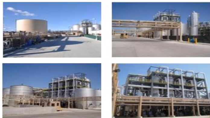
Exhibit 2: Keyes, California Ethanol Plant