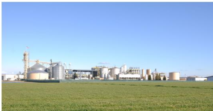
Exhibit 9: Keyes Ethanol Plant