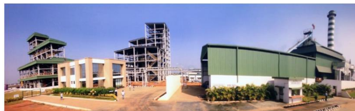
Exhibit 3: India Biodiesel Project

The Indian operation division consists of a biodiesel production facility in Kakinada, India with capacity of approximately 50M gallons per year. The Kakinada Plant processes vegetable oil and animal waste oil into biodiesel. The Kakinada Plant also produces a byproduct called crude glycerin that is further refined into refined glycerin that is sold to several large end markets.