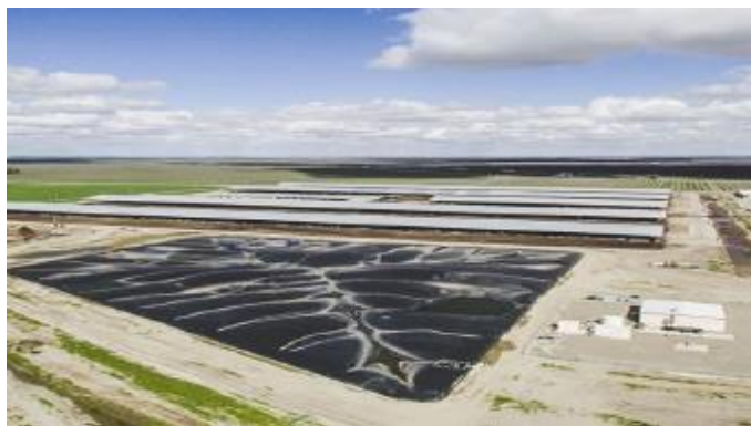
Exhibit 1: Dairy Biogas System