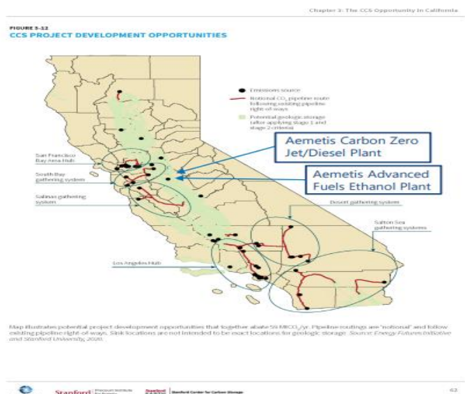
Exhibit 8: Aemetis CCS Projects

In April 2021, the Company established Aemetis Carbon Capture, Inc. to build Carbon Capture Sequestration projects to generate LCFS and IRS 45Q credits by injecting CO 2 into wells, which are monitored for emissions to ensure the long-term sequestration of carbon underground. California's Central Valley has been identified as a highly favorable region for large-scale CO 2 injection projects because of the subsurface geological formation that retains gases.