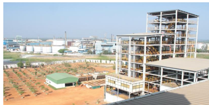
Exhibit 11: Kakinada, India Plant

Biodiesel is produced from vegetable or animal fat waste feedstocks and is then sold as a transportation fuel and a chemical in the textile market. This plant's biodiesel meets the international product standards so it can be sold in the domestic Indian market as well as internationally.