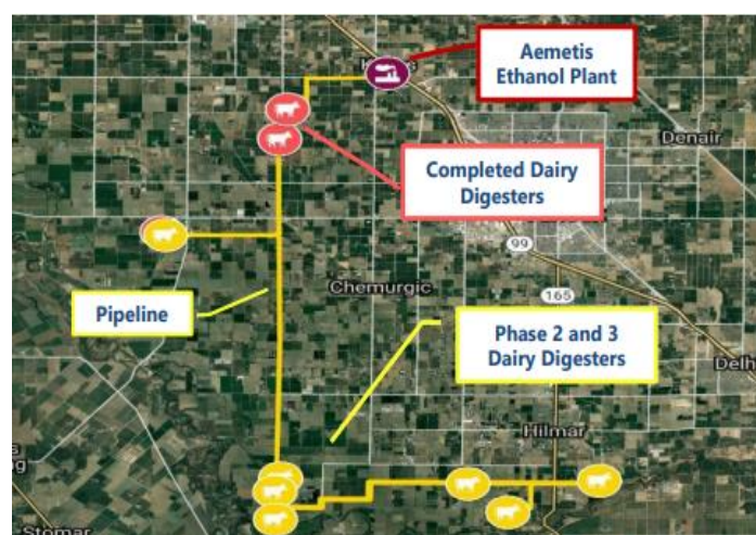
Exhibit 6: Dairy Biogas System